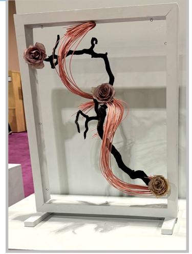
Carrie Schreffler, 2nd Place Large Backed Pedestal Class 129