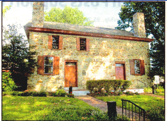
The Uwchlan Meeting House, located at 5 N. Village Ave., Lionville, was placed on the National Register of Historic Places in 1973.